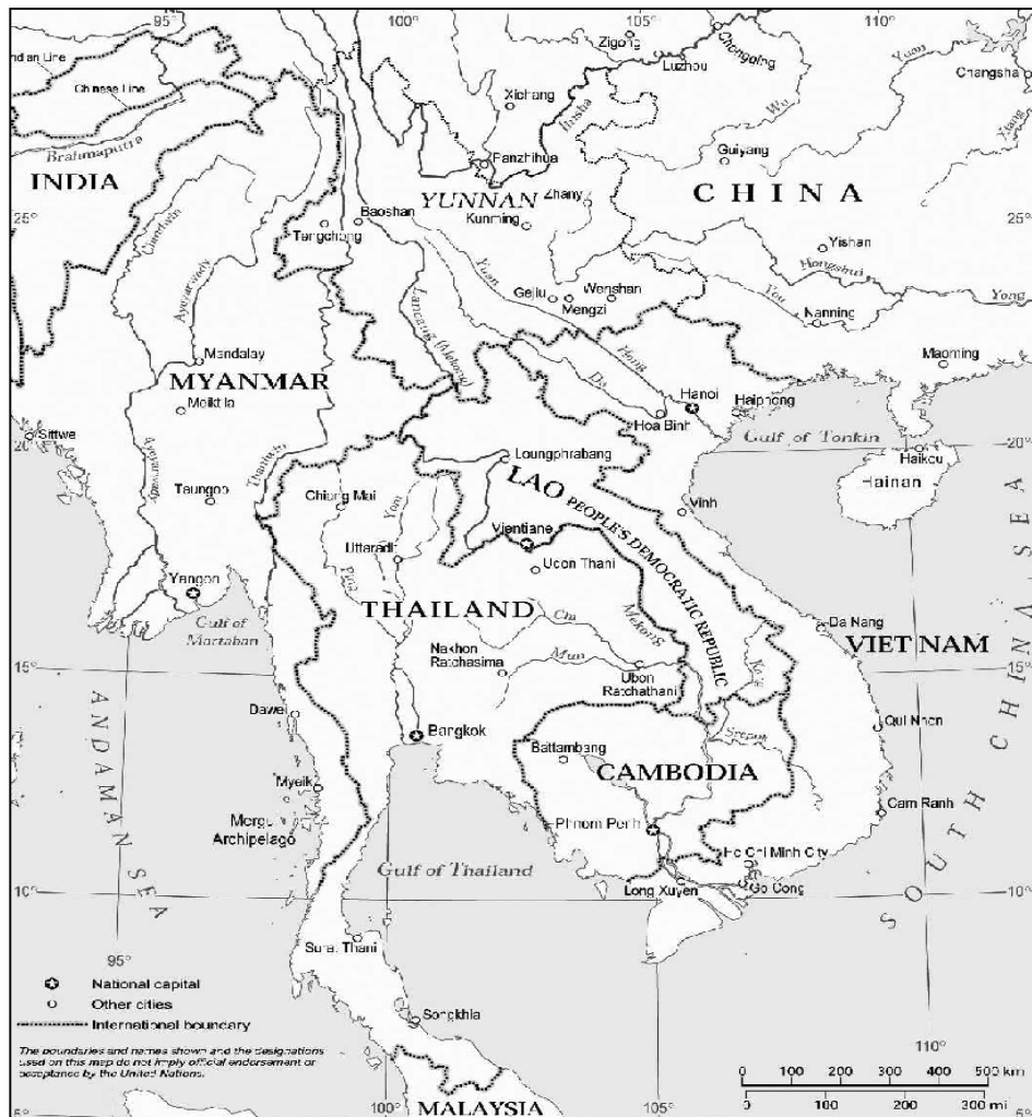
Figure 1 Map of Mekong Region

Source: United Nations map number 4112, July 1999.