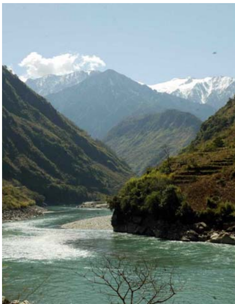
Figure 4 Nu river

The future of the Nu River remains in the balance. In the last months of 2003 and early 2004 much more information has filtered into the public domain outlining the extensive hydropower development proposed for the Chinese section of this river which – upper, lower and middle – extends for 2,018 km. There are advanced plans for a cascade of up to 13 dams 10 on the middle and lower Chinese reaches which, if built, would profoundly alter this presently undammed, near to pristine river. Some supporters of the dams are focused on local development needs, which they hope the dams will assist. Others are focused more on the energy production and income potential for other people and places. Opponents of the dam are doubtful about the need for such radical development and fear the irreversible changes which a cascade will have on the current, mostly undeveloped area. There are many different ‘positions’ in the debate. The total installed capacity of these dams would be 23,320 MW. A site office is operating, and road building has already commenced to facilitate the construction of the Liu Ku dam.